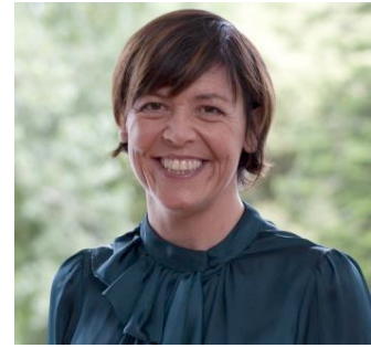
Jan Logie MP