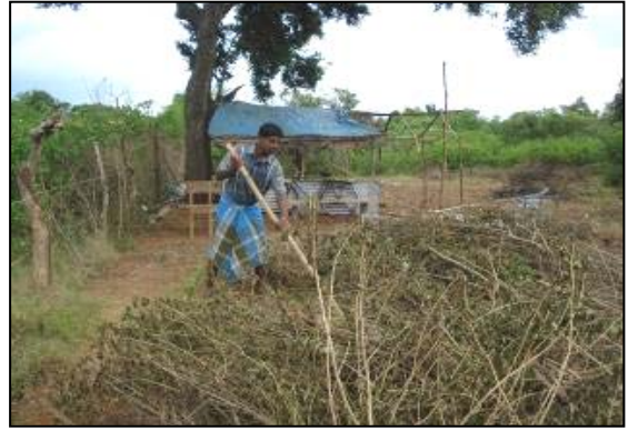
IDP clearing jungle to erect temporary shelter