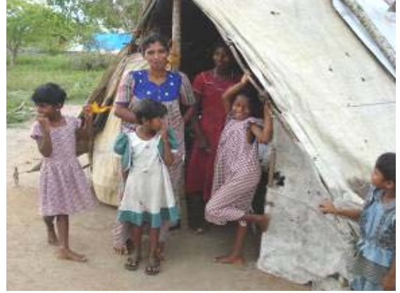
IDP Family from Vellankulam

We request that the overseas Tamils and relatives provide funds so that we can have adequate temporary shelters/homes, food, and medicine."