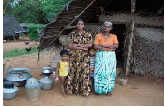
IDP Family from Madhu Church area

Periyamadhu (where they displaced from) and Kanesapuram are in close proximity as such we would like to stay in Kanesapuram. We are in a safe area now, but we need temporary shelters and access to drinking water. The overhead water tank that MANREP was constructing is not completed. We therefore need water tankers to bring drinking water. We also need to erect temporary toilets to prevent a disease outbreak. We welcome the erecting of 87 toilets built by SOLIDAR at the rate of one