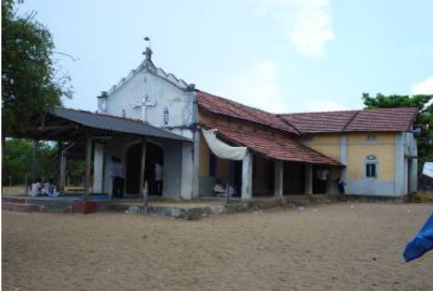
St Sebastian Church – Thevanpidy (exterior)

Headquarters Office: Jaffna Road (A9) Kilinochchi