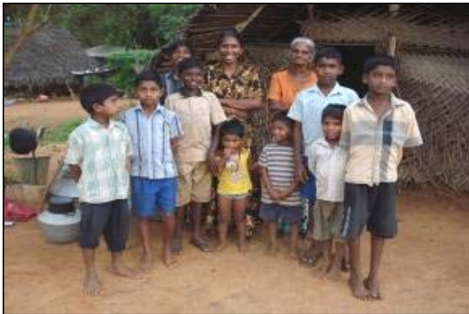
Displaced children from Madhu