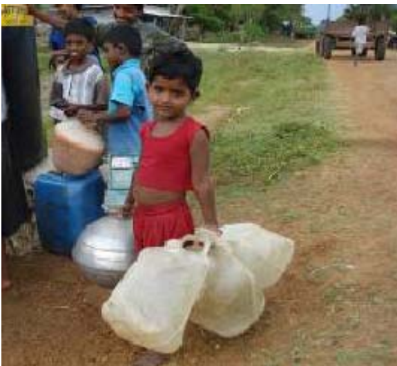
Five year old girl displaced from Mannar. This is her first experience of war as she was born after the 2002 Ceasefire Agreement.

All the Internally Displaced Persons (IDPs) were provided safe, temporary accommodation in the areas mentioned