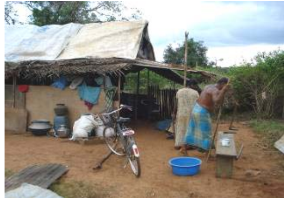
IDPs from Madhu