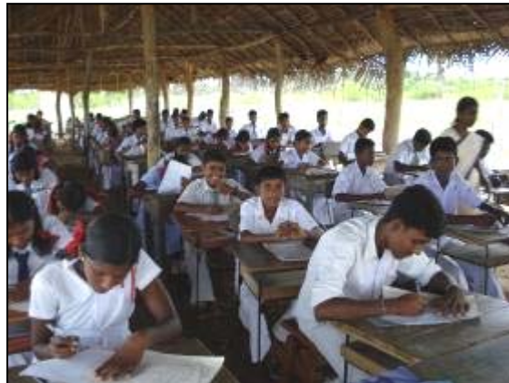
Displaced School – Thevanpiddy GTMS