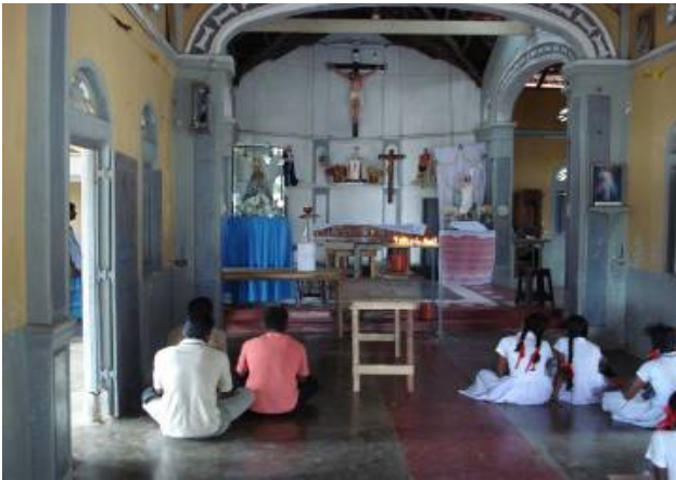
St Sebastian Church – Thevanpidy (interior)

The Tamil Rehabilitation Organization (TRO) continues to make arrangements and transport the IDPs from the place of displacement to the areas they wish to be temporarily settled. TRO is also constructing and providing shelters, drinking water, health, Non-Food Relief Items (NFRI) and other emergency relief assistance. The UN, INGOs, and local NGOs are providing medical and other humanitarian assistance to the IDPs.