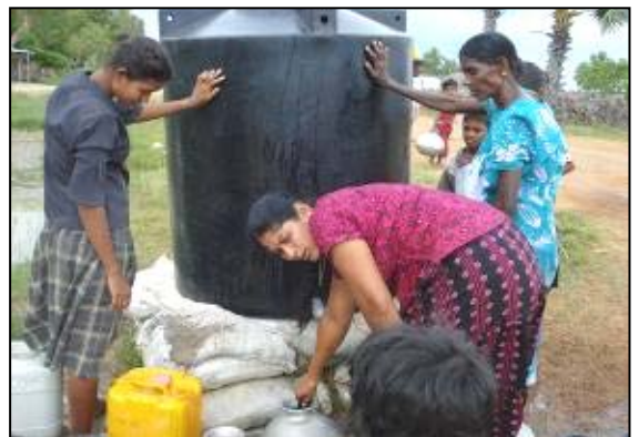
IDPs collecting drinking water in Mullankavil IDP Camp