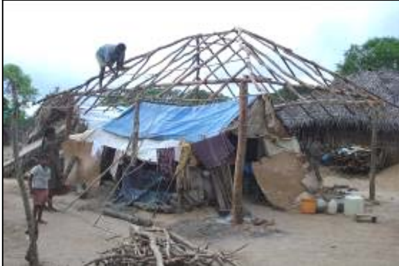
IDPs building their Temporary Shelters with materials provided by TRO

toilet per four shelters. At the current rate of displacement this is not enough for health reasons.