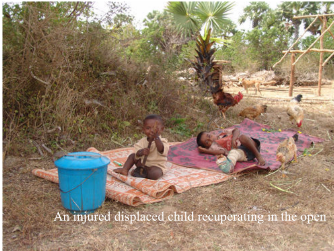
An injured displaced child recuperating in the open

The large scale displacement in Vanni is the latest humanitarian catastrophe taking place in the Tamil homeland. The entire displacing population is doing so due to fear of the Sri Lankan military, either because of its indiscriminate shelling or because the people fear infiltration by the military.