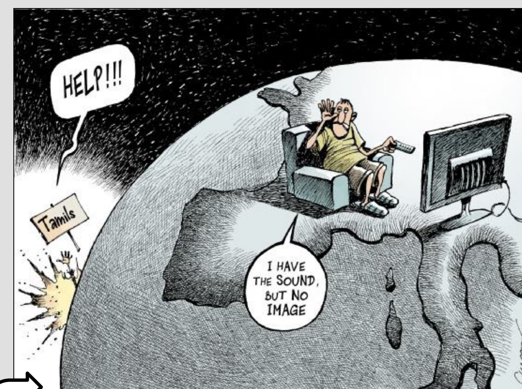
Chappatte in 'International Herald Tribune' - http://www.ihrt.com/2009/09/09/090909.html , 2009 - reproduced with permission.

Demand as the first step an International Independent enquiry that embraces the historical context in order to expose the scale of the crimes by the State, both historic crimes and on-going human rights violations.